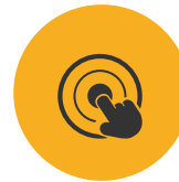
User-Friendly Touch Screen