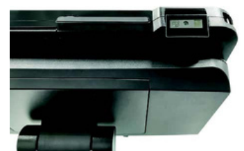
Rotatable 2D barcode scanner